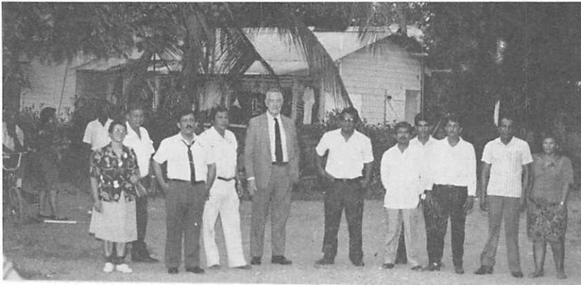
A HOME IN THE BACKGROUND WHERE THE BANANA WORKERS LIVE

This seminar was sponsored by a group of churches which had rented the conference room. Most of those in attendance wrote their names and addresses and asked for literature and our monthly newsletter. One pastor said: "These seminars are very important for our country because Communism is definitely not dead in Latin America. It is the victims of Communism who are dead."