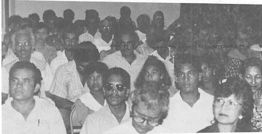
THE CROWD LISTENS ATTENTIVELY AT THE UNIVERSITY IN CHITRE, PANAMA

Driving north, we reached the city known as "David Chiriqui", where we spoke for 45 minutes over radio. The estimated audience was 50,000. We then proceeded to conduct our seminar. Most of those attending were university students. One student group, called "Kai Alpha", presented us with a written petition asking for our literature. They also invited us to return and give lectures at the university.